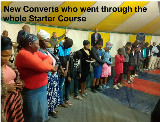
New Converts who went through the whole Starter Course