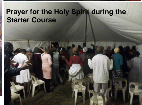
Prayer for the Holy Spirit during the Starter Course