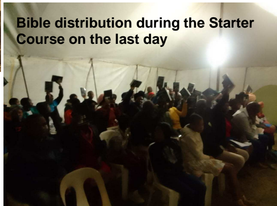
Bible distribution during the Starter Course on the last day