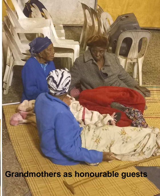
Grandmothers as honourable guests